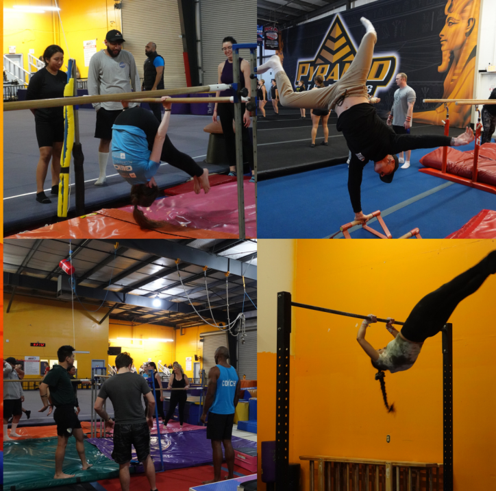
(Group pictures of our Calisthenics Class and Adult Class members above)